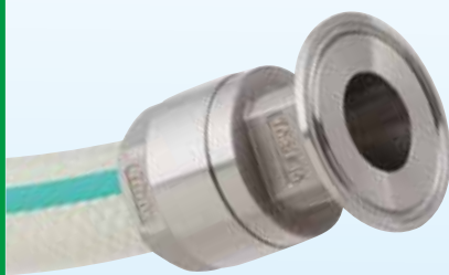
TOYOCONNECTOR TC3-F ( Type without resin ring )

Now introducing the color identification type !